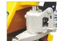
Integrated cast pump