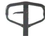
*Option: rubber wrapped handle