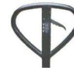
*Standard: metal handle