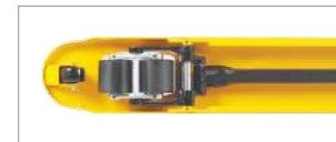
Standard with entry & exist Roller (option with single or double fork rollers)